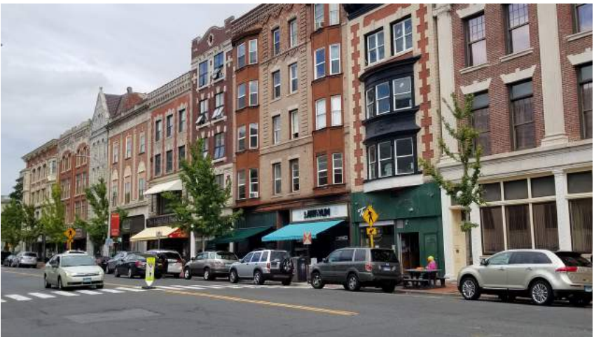
Grand Street Waterbury

Still have questions? Contact CMSC for advice and recommendations on how best to address your revitalization needs.