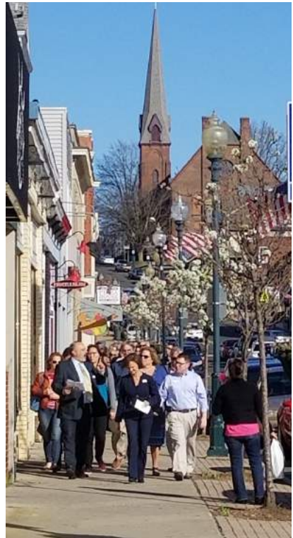
Center Street Wallingford Back Cover: Church Street Naugatuck

Watch for additional webinar announcements