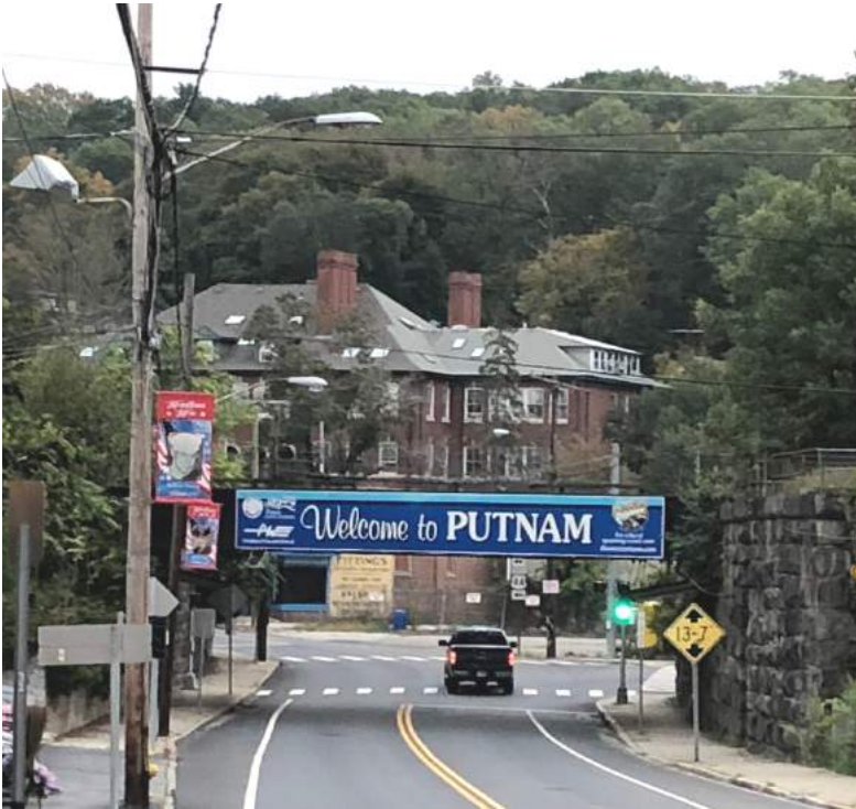
Front Street Putnam