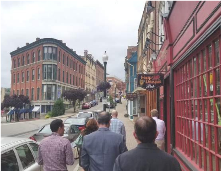
Main Street Norwich

Al Carbone 100 Marsh Hill Road Orange, CT 06477 203.499.2247 Albert.Carbone@avangrid.us www.avangrid.us