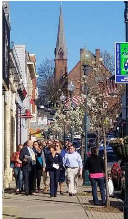
Center Street Wallingford

Dates are subject to change – check our website for all upcoming Main Street happenings: www.ctmainstreet.org