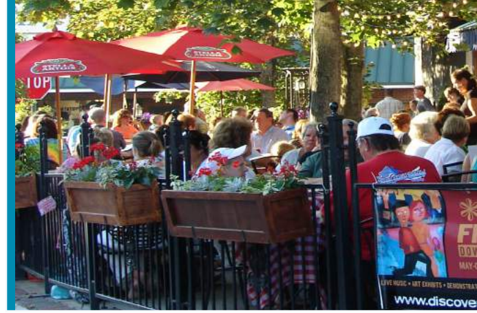
Putnam First Friday event.

A vital downtown has a positive impact on the entire community. It increases economic activity, pays taxes, makes streets safer, and improves the quality of life for all residents. Ideally, a downtown area should be a thriving center of commercial and social activity. But reviving abandoned or underutilized central business districts can be a complex and time consuming process. That's where we come in.