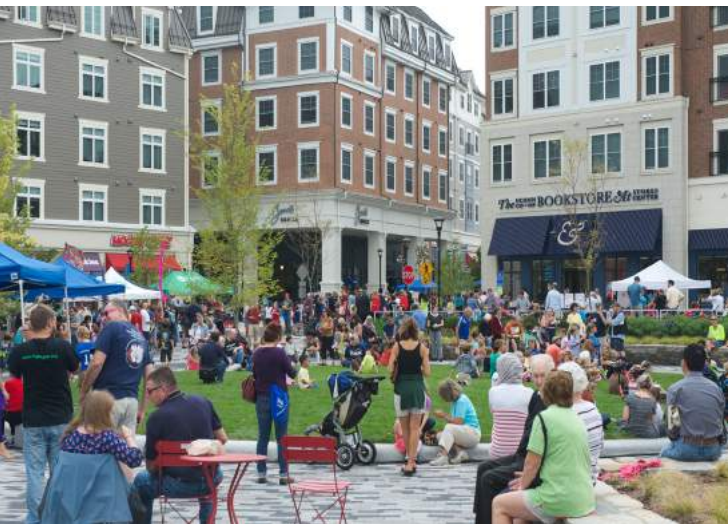
Right: Town Square in the heart of Storrs Center. Left: Bristol Rising Pop Up Piazza Festival.

Economic Vitality – Increasing economic value by encouraging diversity among current and new businesses suitable to the unique needs of a particular marketplace.