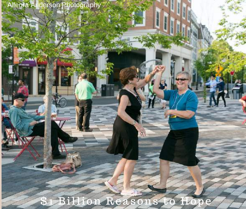
$1 Billion Reasons to Hope