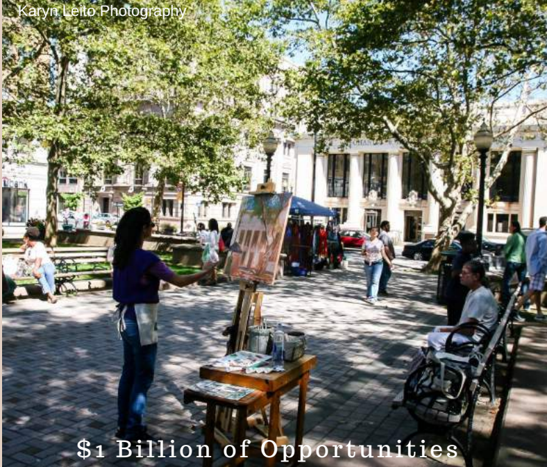
$1 Billion of Opportunities