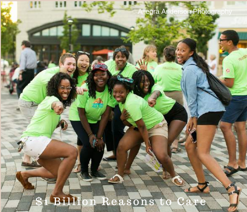
$1 Billion Reasons to Care