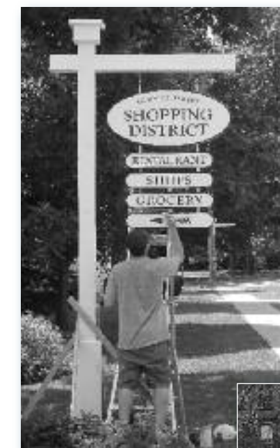
(left) Northwest CT Regional Planning Collaborative conducted signage & wayfinding workshops with municipal leaders and merchants to determine designs for the region's village centers. Sign installation on Salisbury's Main Street.