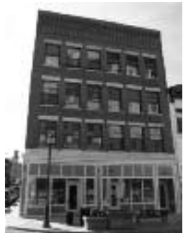
The Hodson Building, home of the Bank Street Apartments in downtown Waterbury. Winner of the 2011 Award for Adaptive Reuse.