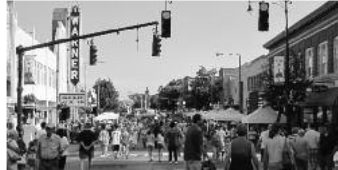
Torrington's Main Street Marketplace, winner of the 2011 Award for Ongoing Event.