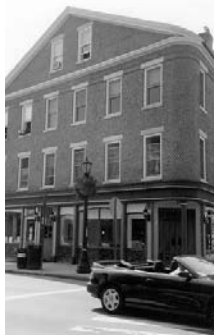
Hygienic Building on Bank Street, New London

This program provides a 30% tax credit for the rehabilitation of historic properties for any use. In the first three years, the State of Rhode Island's $145 million investment generated $795 million in economic activity, $179 million in additional property taxes and $42 million in additional sales and income taxes. 25% of all qualifying housing units were designated affordable.