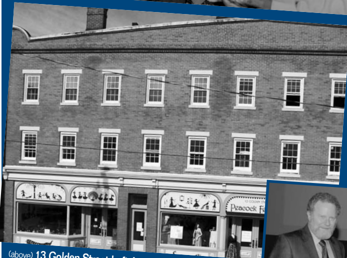
(above) 13 Golden Street Loft Apartments & 1st Floor Retail, by The McLaughlin Companies, LLC in downtown New London, won the award for Building Rehabilitation.